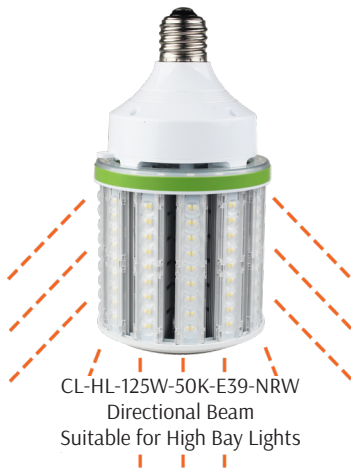
CL-HL-125W-50K-E39-NRW Directional Beam Suitable for High Bay Lights