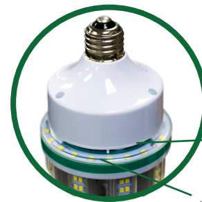
Reversible Mogul Base